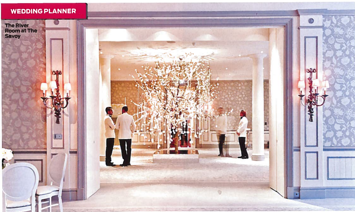
The River Room at The Savoy