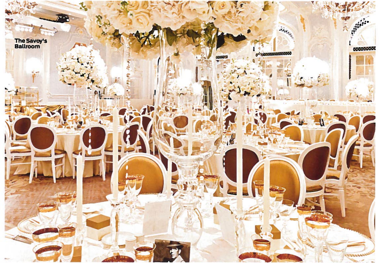
The Savoy's Ballroom